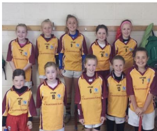
U10 TEAM THAT PLAYED V FR O'NEILLS